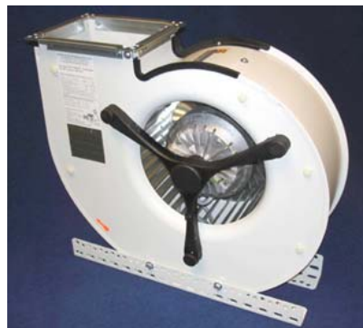
Type CFE .. single inlet, super flat Alternation Current: 230V/1N~, 50Hz